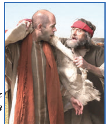
Prophets Elijah & Elisha